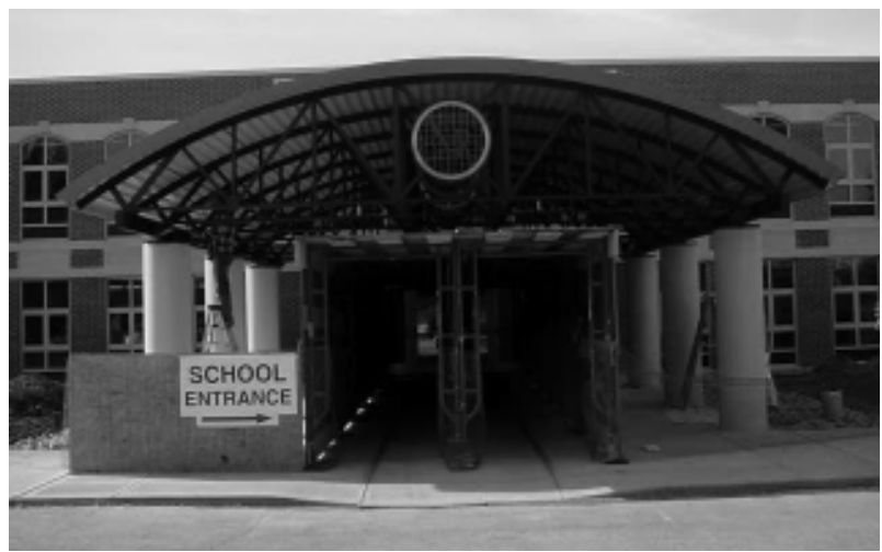
Are you afraid of the dark? With signs and arrows, it's unmistakable that the school entrance lies just beyond the light.