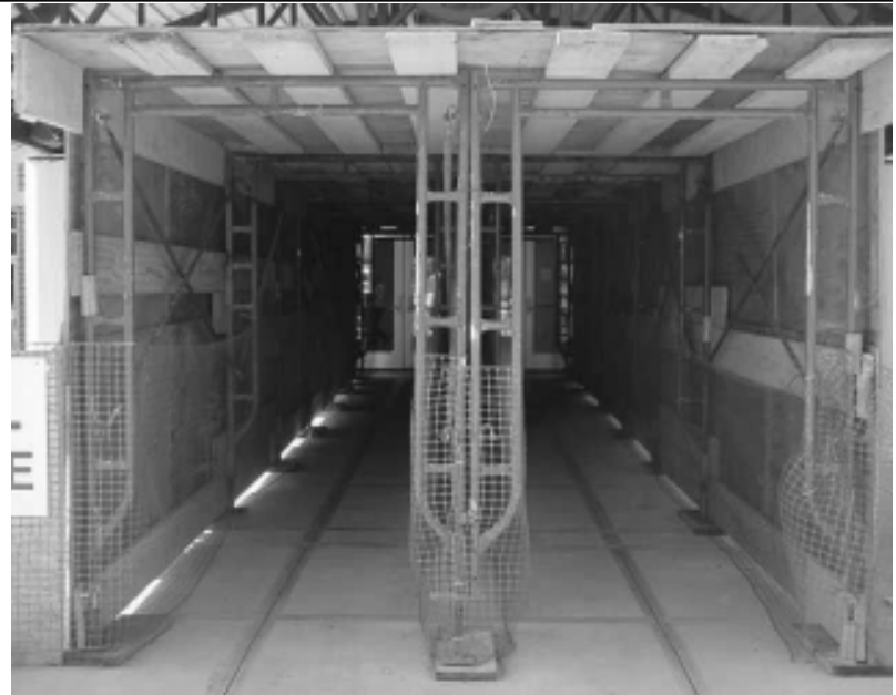
E.T. come home! Yes, the infamous tunnel students were ushered through in order to reach the main entrance.

But she said she was very impressed at the way everyone handled it. "The custodians and maintenance staff did a tremendous job getting the